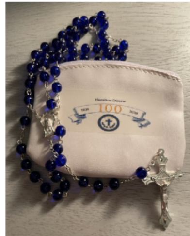
Rosary & Pouch $5