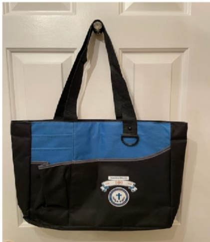
Tote Bag $5