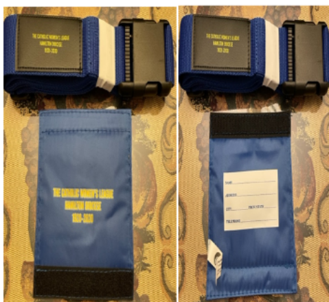
Luggage Tag & Luggage Belt $5