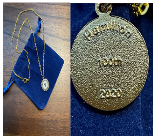
Engraved Gold Pendant & Chain $10