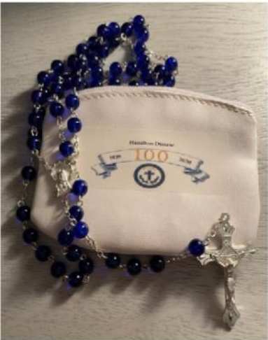
Rosary & Pouch $5