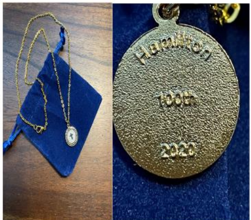
Engraved Gold Pendant & Chain $10