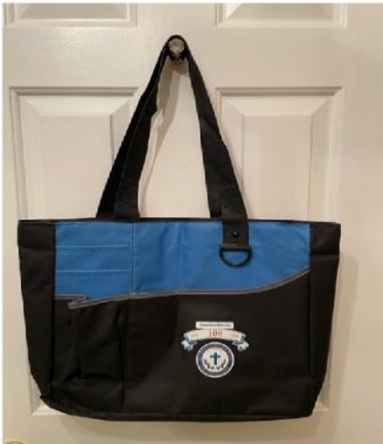
Tote Bag $5