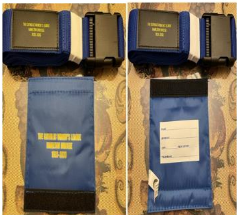
Luggage Tag & Luggage Belt $5