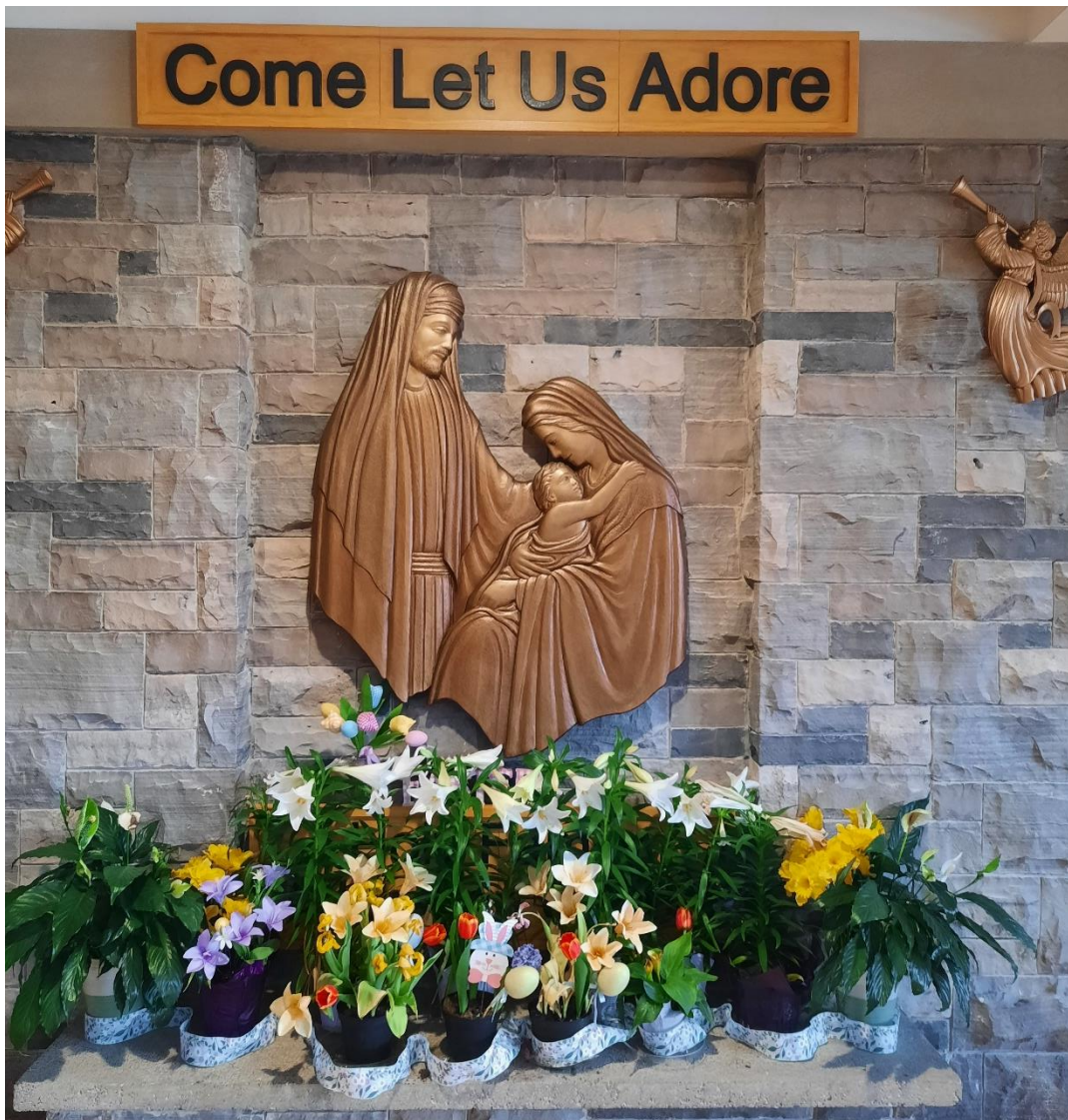
Mary Mother of God, Oakville

Paul is exhorting us to live our lives modeled on Christ. Though in nature we put on the earthly body (Adam), we must live as if we belong to heaven (Christ). For in our resurrection, we will put on imperishability. In baptism we are 'already' given assurance for eternity, but we are 'not yet' there. It is in Christ's death that we are made partakers of the heavenly body.