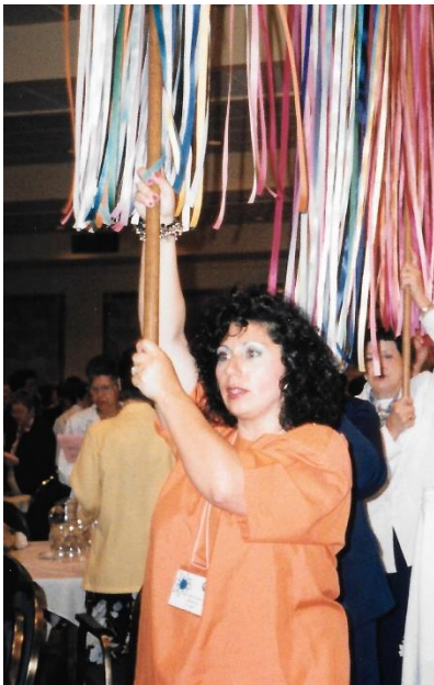
Provincial Convention 2001