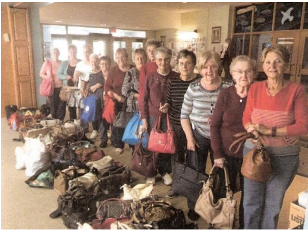
Purses of Love

Holy Family, Hanover Celebrating 100 th Anniversary