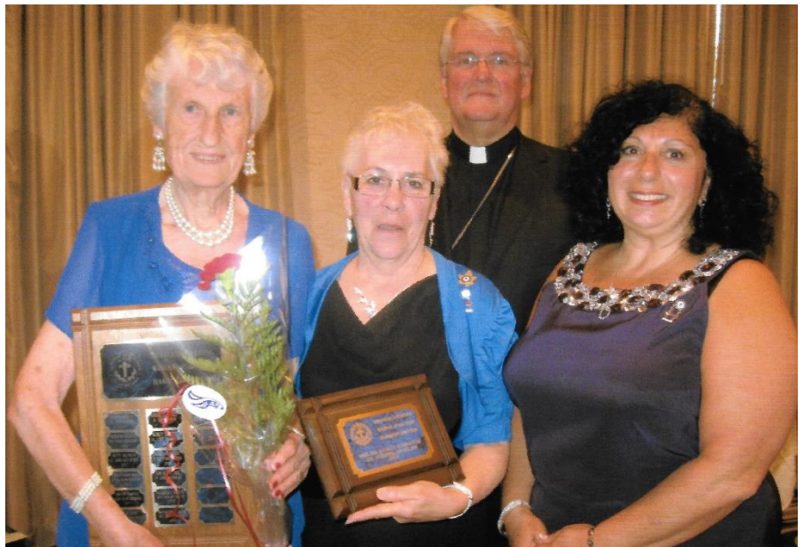
Diocesan Convention 2009