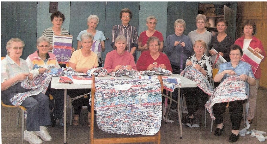
Milk Bag Mats