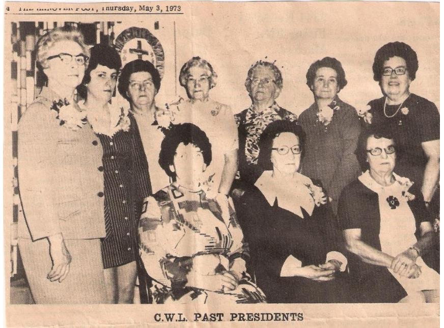
C.W.L. PAST PRESIDENTS