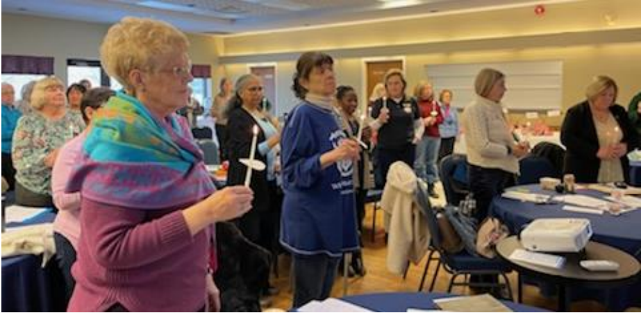
The Brant/Hamilton Spring Regional Meeting was held on March 11, 2023 by gracious host council Holy Rosary, Burlington.