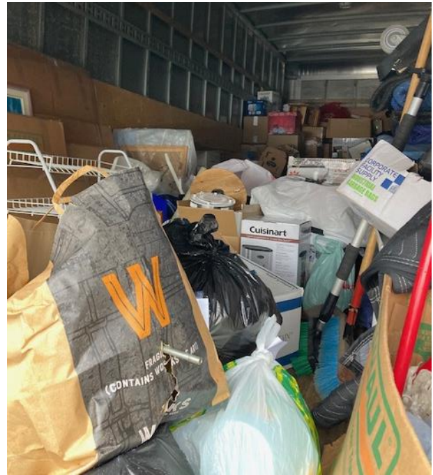
Household goods collection for The Good Shepherd at St. Dominic, Oakville