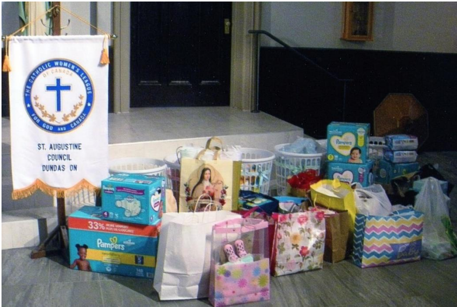
Birthright Baby Shower at St. Augustine, Dundas