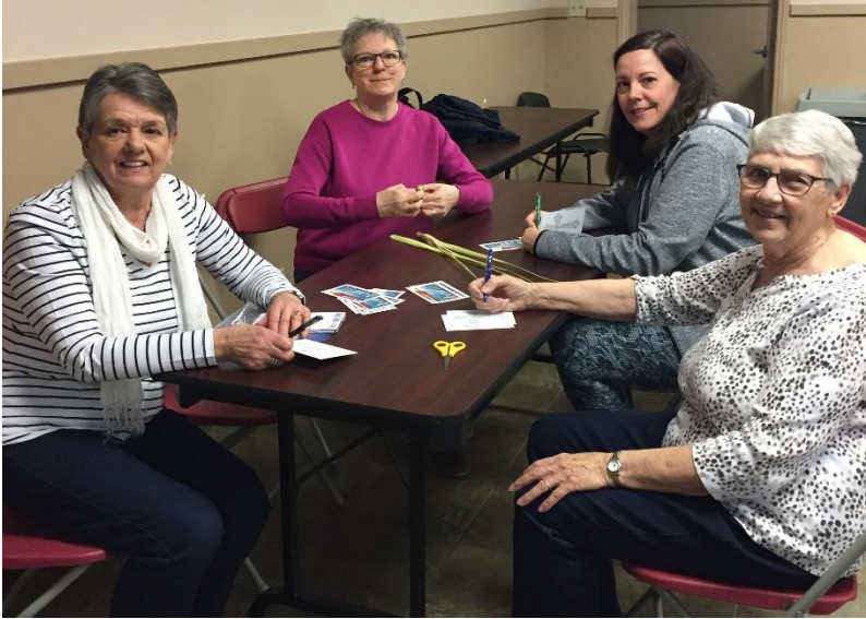
Making Palm Crosses