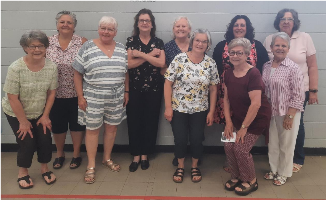
St. Basil, Brantford