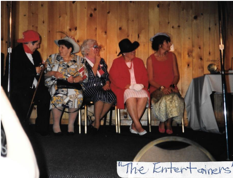
Provincial Convention 1992