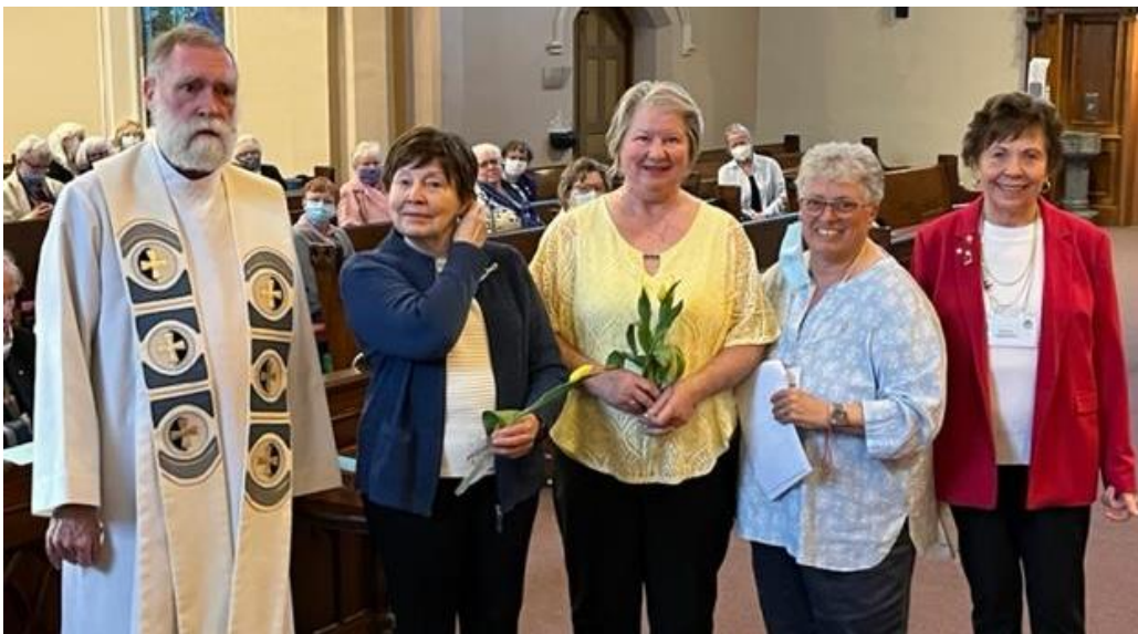
Presentation of Membership Pins

Each year we present a $500.00 bursary cheque to a deserving high school graduate who must submit an essay to us outlining how they are living a Christian life. Four young children were presented with gifts on the day of their First Communion.