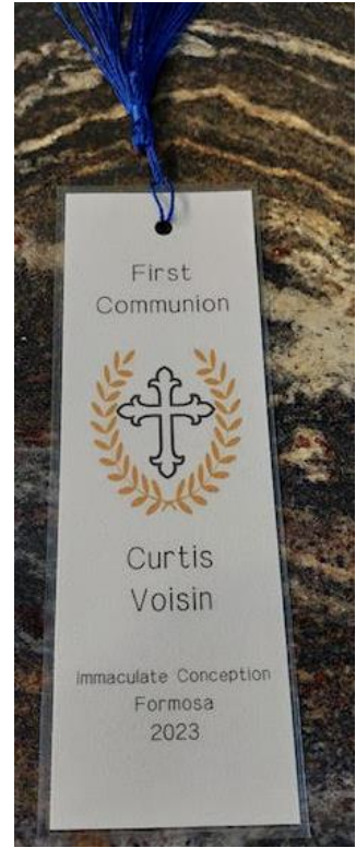
First Communion Bookmark