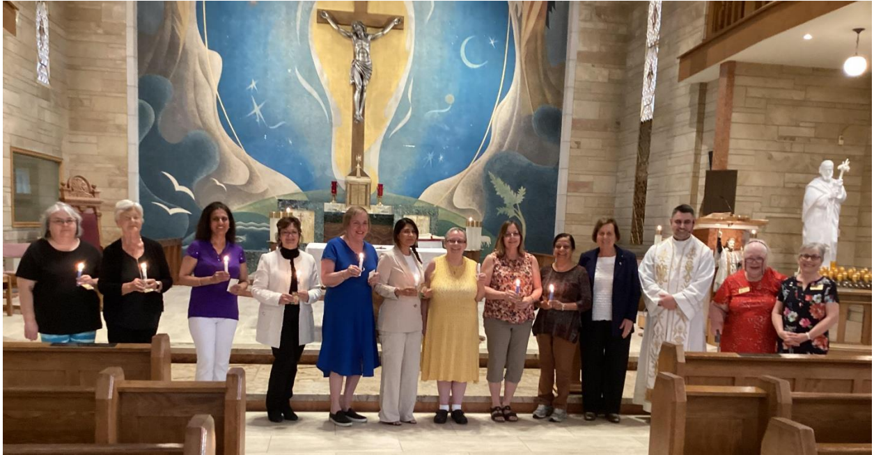
Reception of Ten New Members