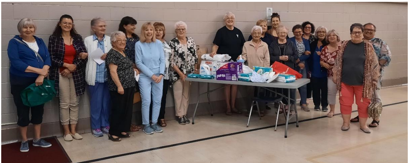
Members collected items for the Hope Pregnancy & Family Support Centre