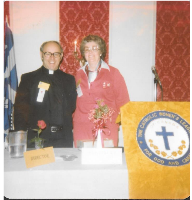
Diocesan Convention 1977