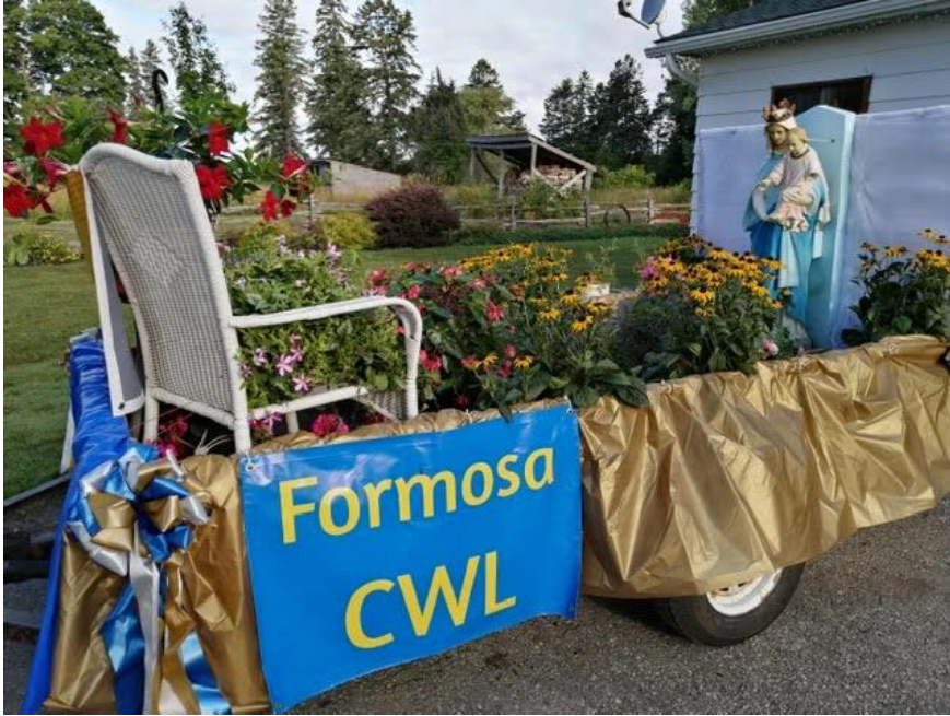
Float for homecoming parade