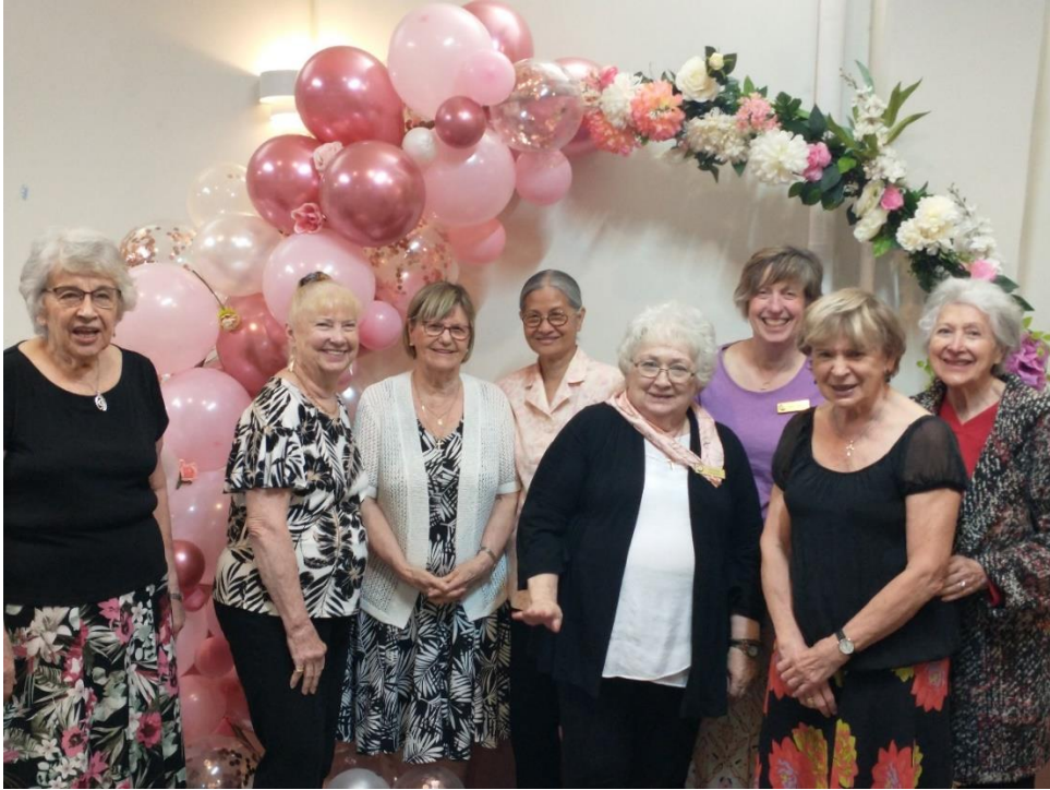
St. Raphael, Burlington